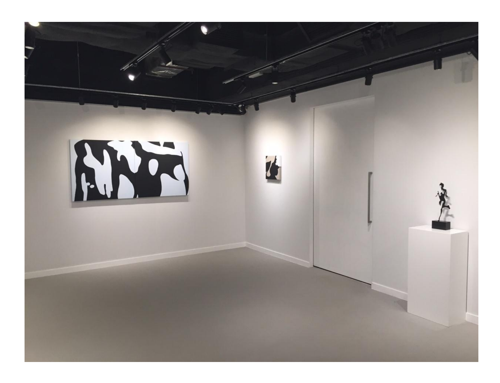
The Silence of Shadows, Exhibition Installation View