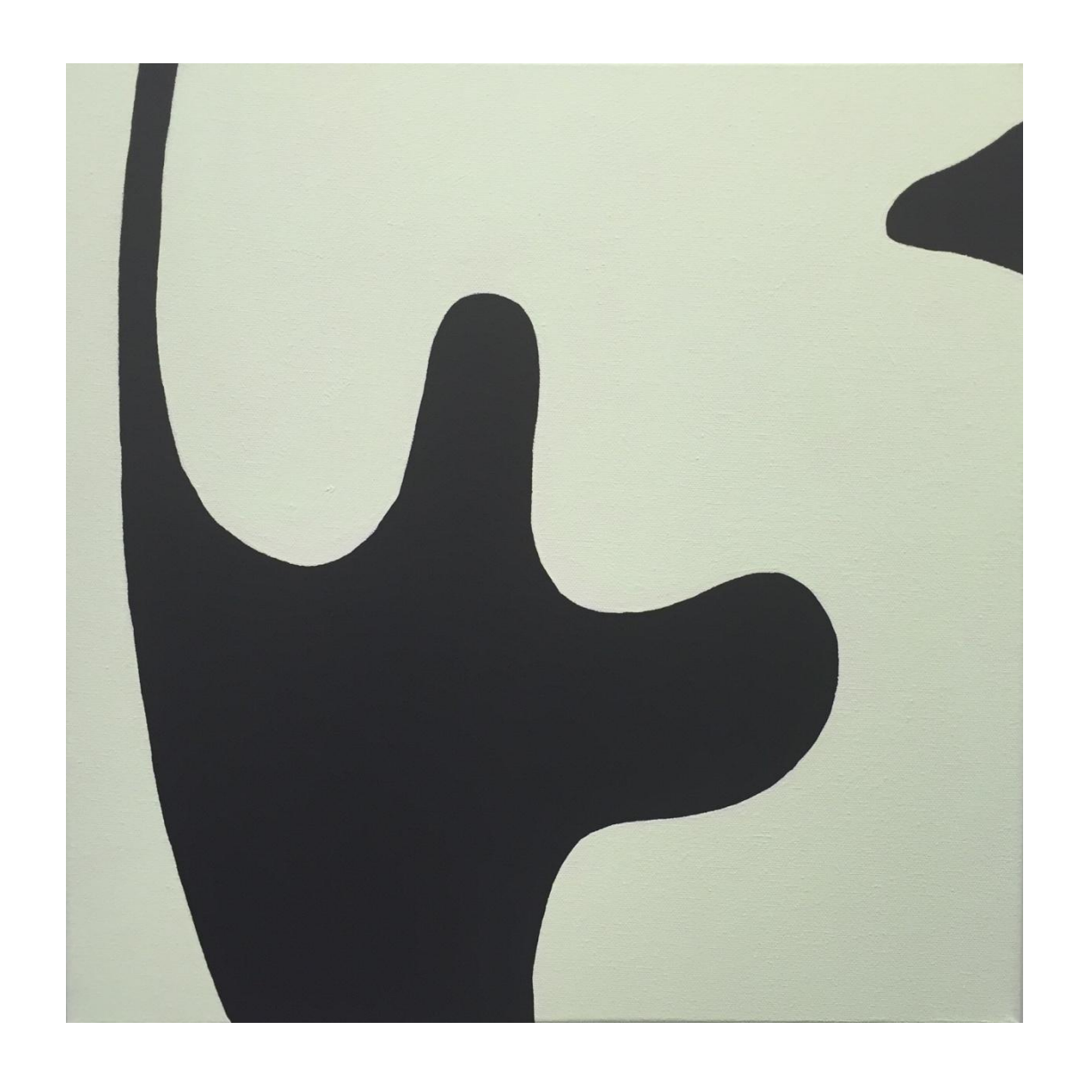
Shadow 43, 2015, Black Gesso and Distemper on Canvas, 40 x 40 cm