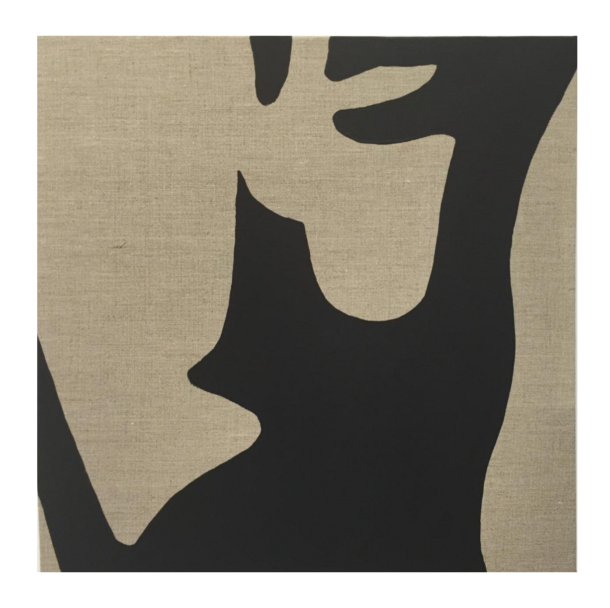
Shadow 37, 2015, Black Gesso on Raw Linen Canvas, 40 x 40 cm