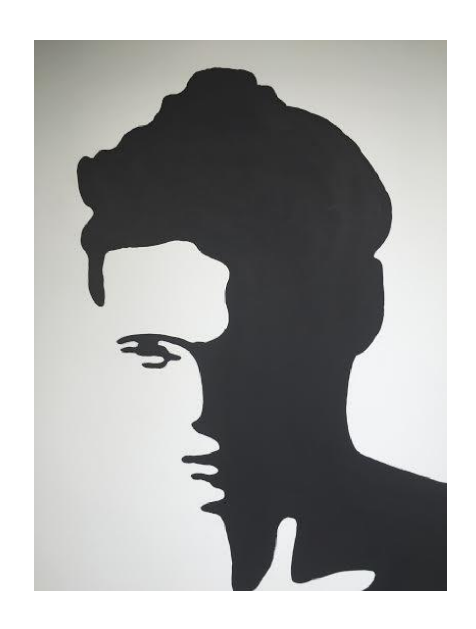
Shadow 36 (Detail), 2015, Wall Painting representing larger than life-size sculpture available on commission, 240 cm high