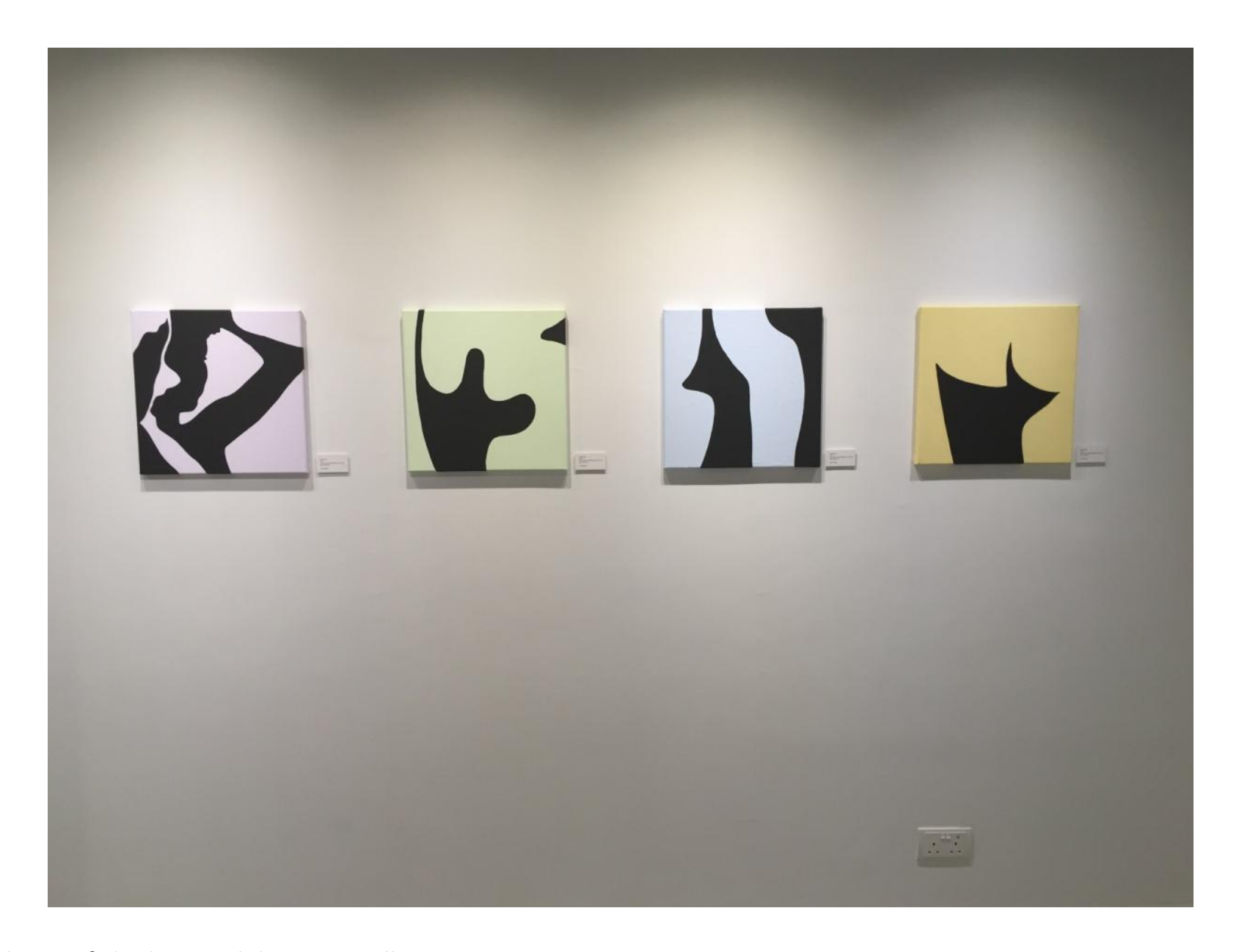
The Silence of Shadows, Exhibition Installation View