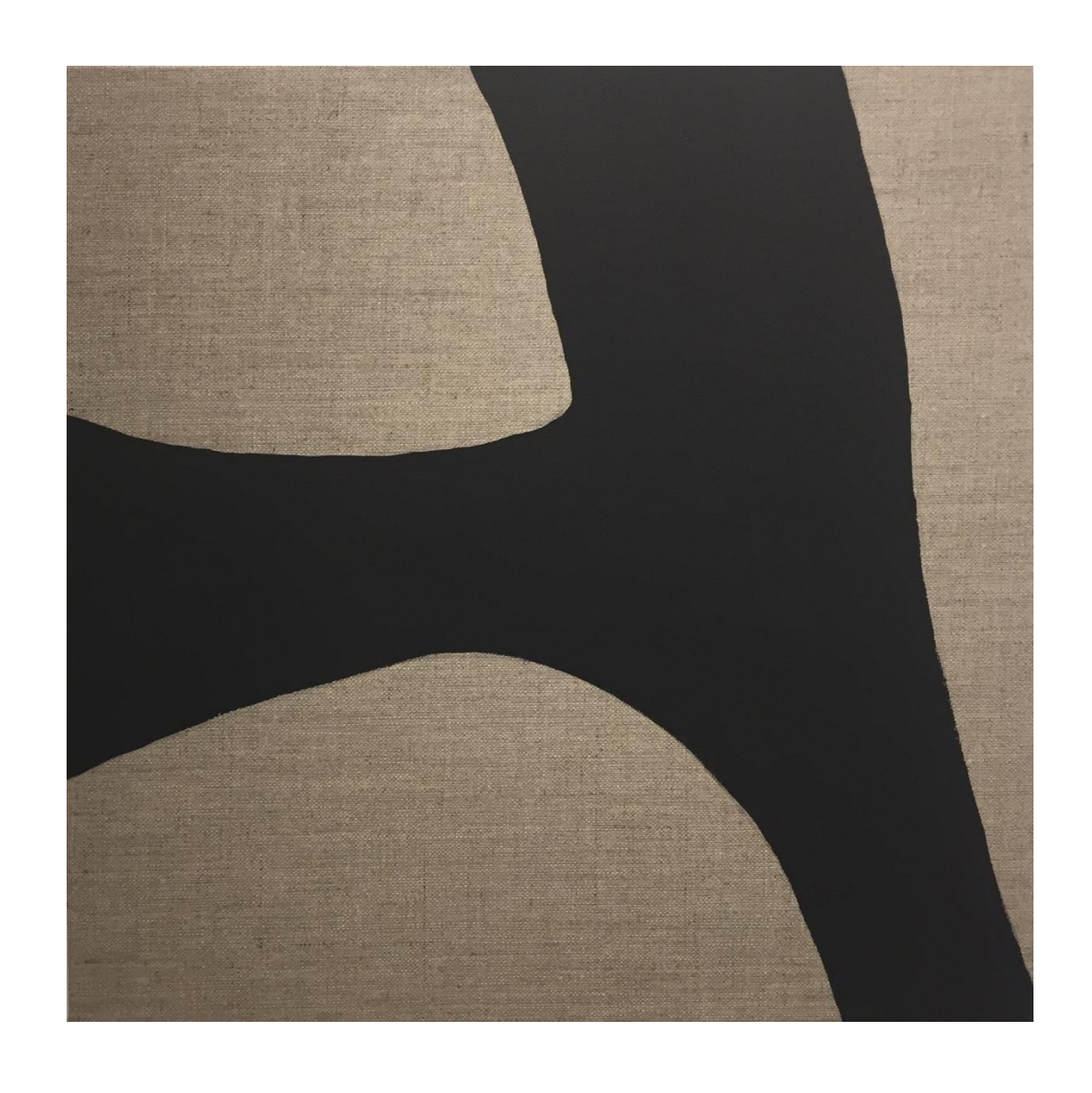
Shadow 39, 2015, Black Gesso on Raw Linen Canvas, 40 x 40 cm