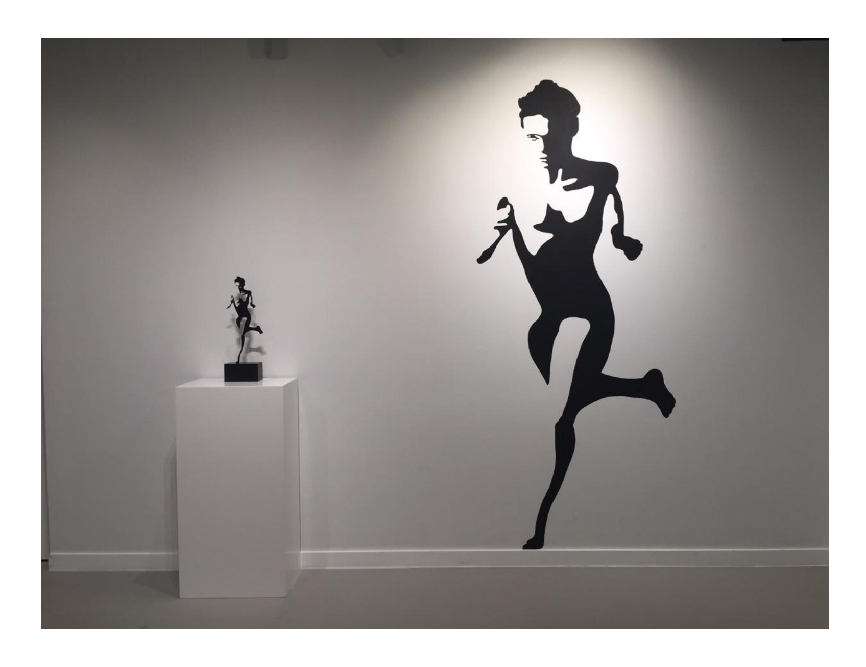
The Silence of Shadows, Exhibition Installation View