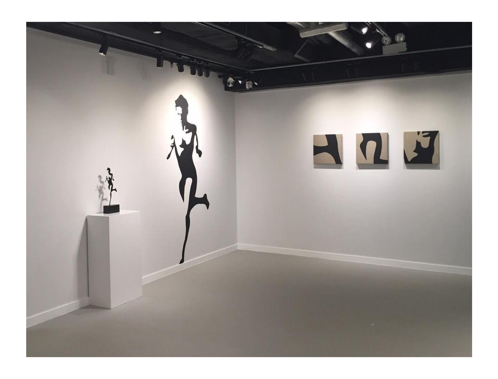
The Silence of Shadows, Exhibition Installation View