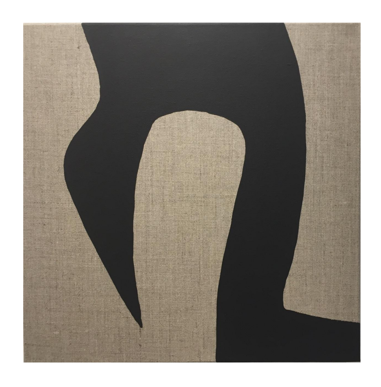
Shadow 38, 2015, Black Gesso on Raw Linen Canvas, 40 x 40 cm