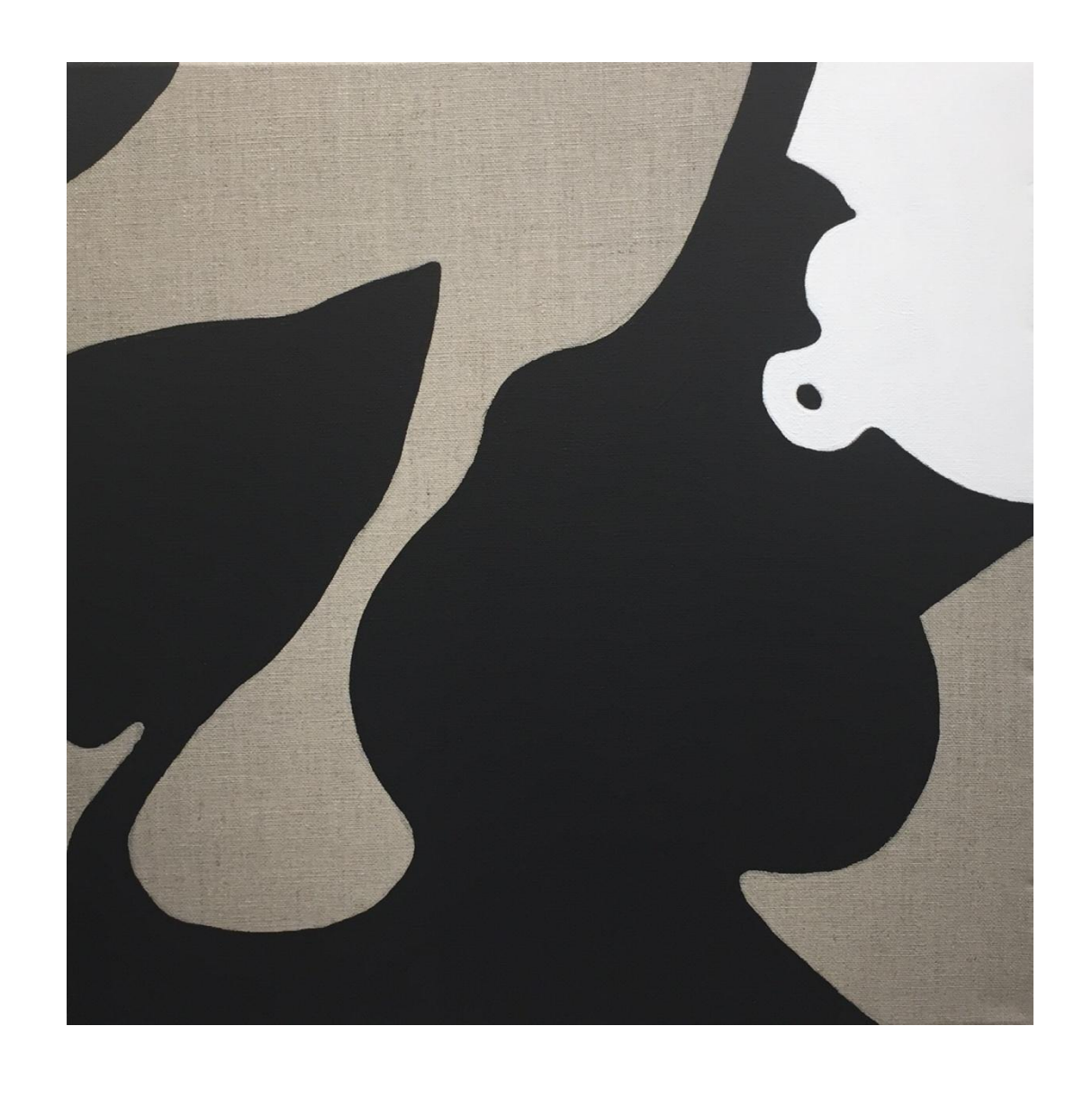
Shadow 45 (After Picasso), 2015, Black and White Gesso on Raw Linen Canvas, 40 x 40 cm